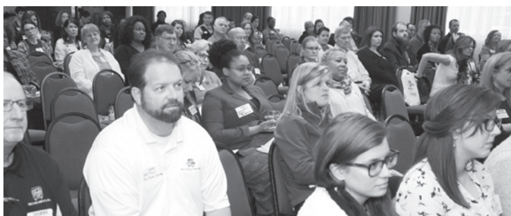
Embassy Suites is the venue for all Workplace Workshops.