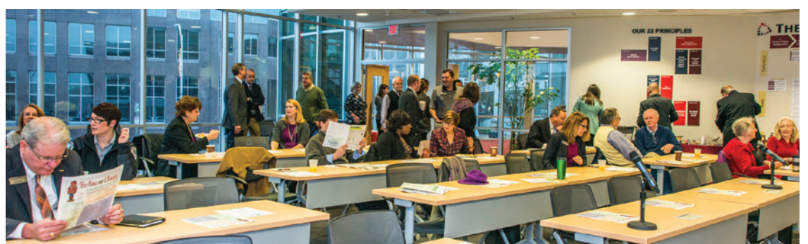
Networking in a meeting room at Charles Aris Inc. before December's Center City AM Briefing.

Trends is a publication of the Guilford Merchants Association.